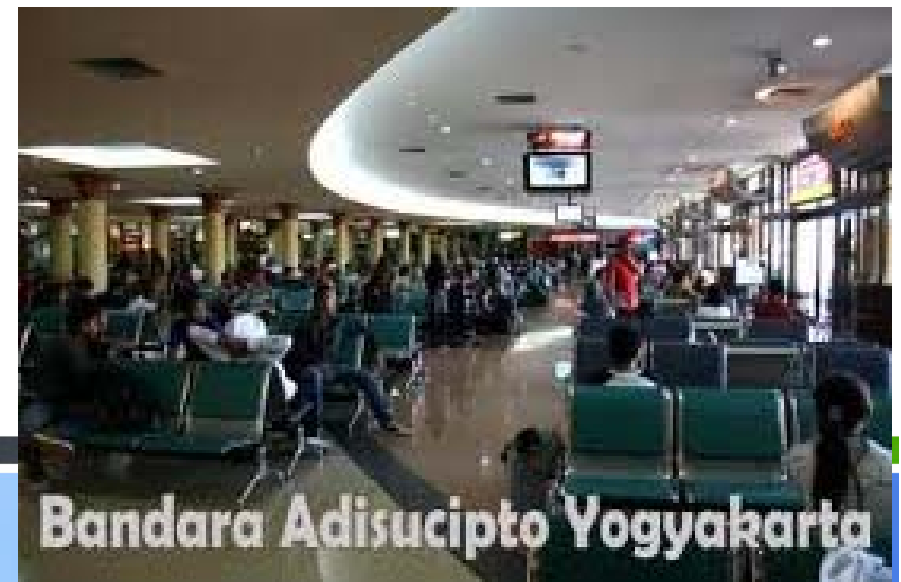
Bandara Adisucipto Yogyakarta